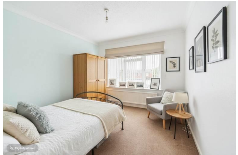
Bedroom 2 - Virtually Staged