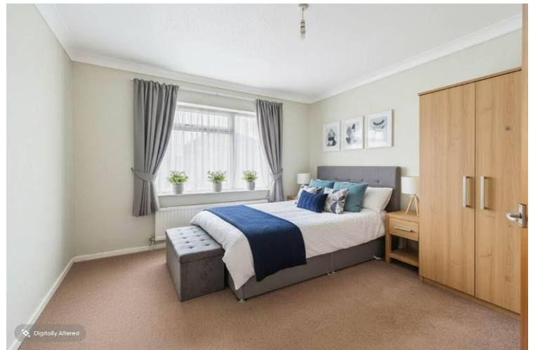
Bedroom 1 - Virtually Staged