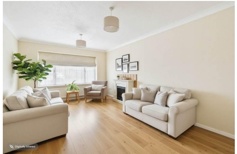
Lounge - Virtually Staged