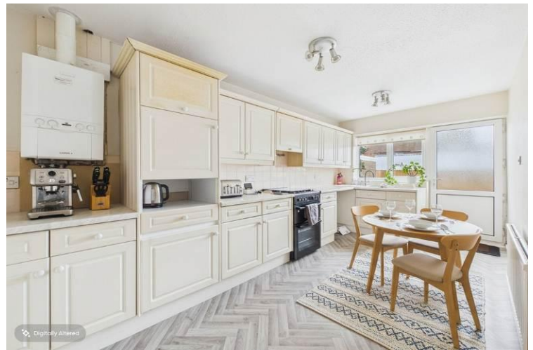
Breakfast Kitchen - Virtually Staged