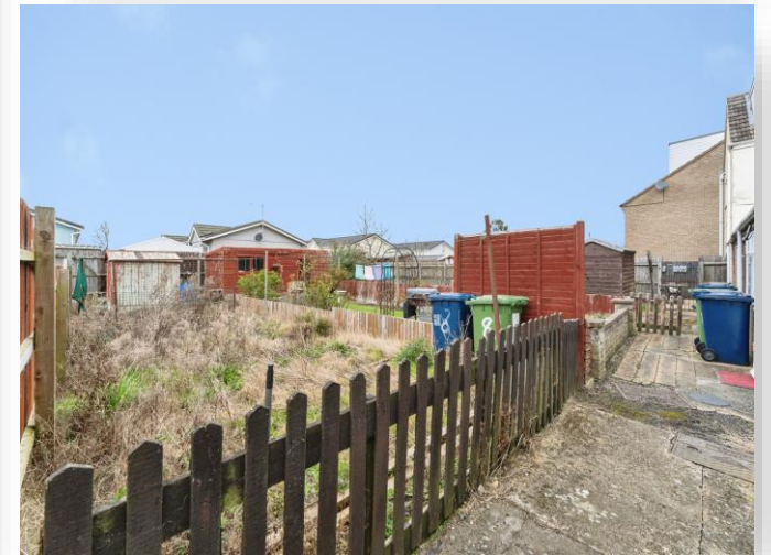
Lime Grove, March PE15 8JG