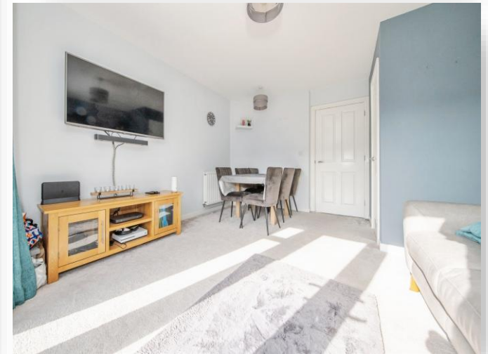
Limestone Close, Great Blakenham, Ipswich, IP6 0FG