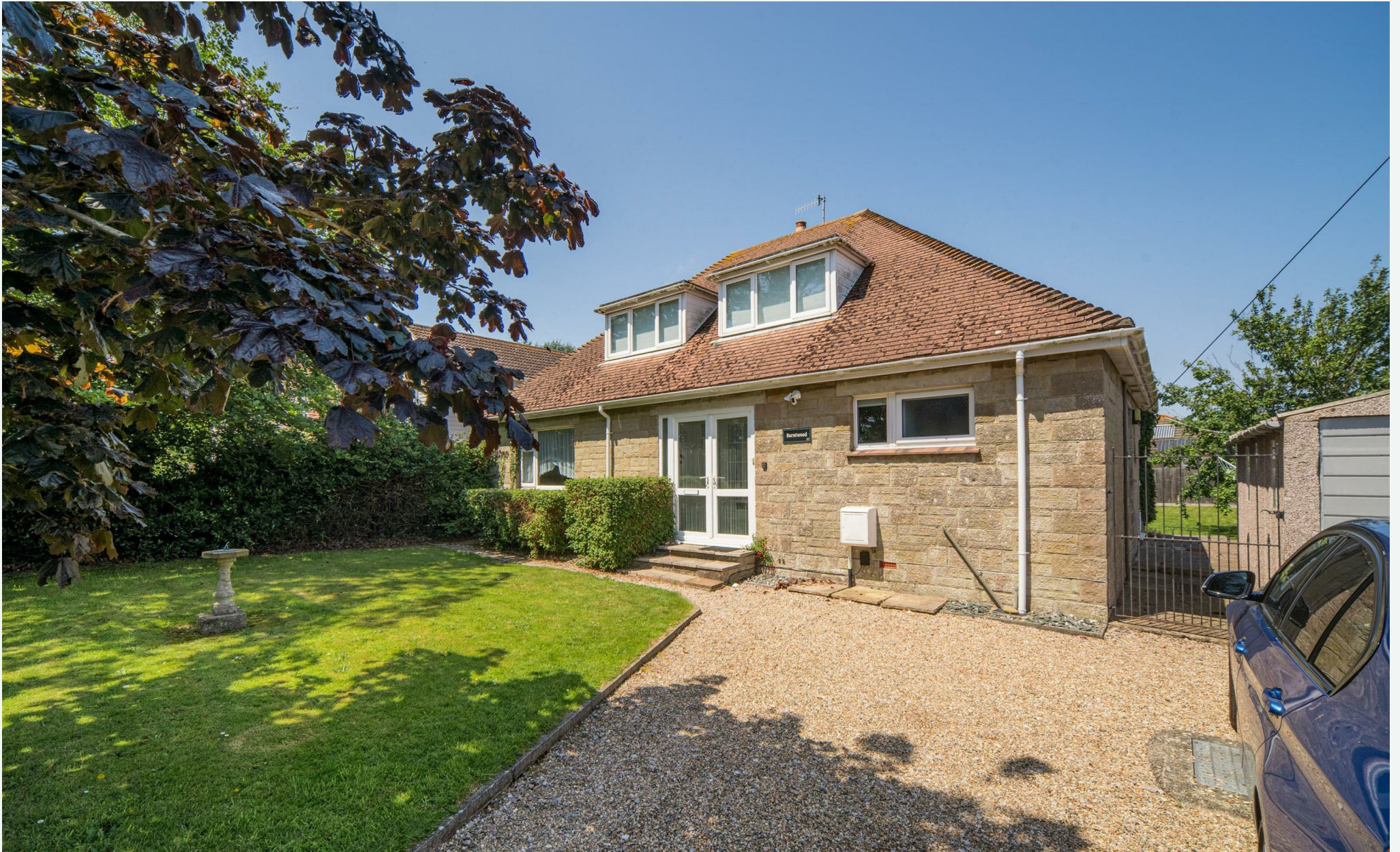
Burntwood 117 Howgate Road, Bembridge, Isle of Wight, PO35 5TQ