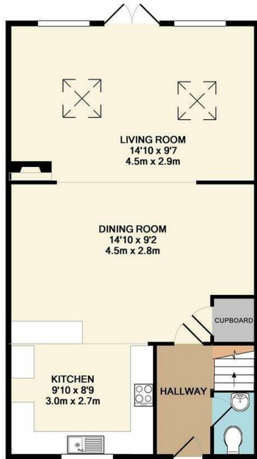
GROUND FLOOR APPROX. FLOOR AREA 809 SQ.FT. (75.1 SQ.M.)

**AVAILABLE NOW** Three-bedroom end-of-terrace house, in the village of Fordham. Set in a peaceful location, this property is close to local amenities. The property offers living room, kitchen, conservatory, three bedrooms and two full bathrooms plus a cloakroom toilet. With rear enclosed garden and off-road parking.