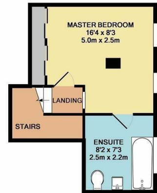
2ND FLOOR APPROX. FLOOR AREA 330 SQ.FT. (30.7 SQ.M.)