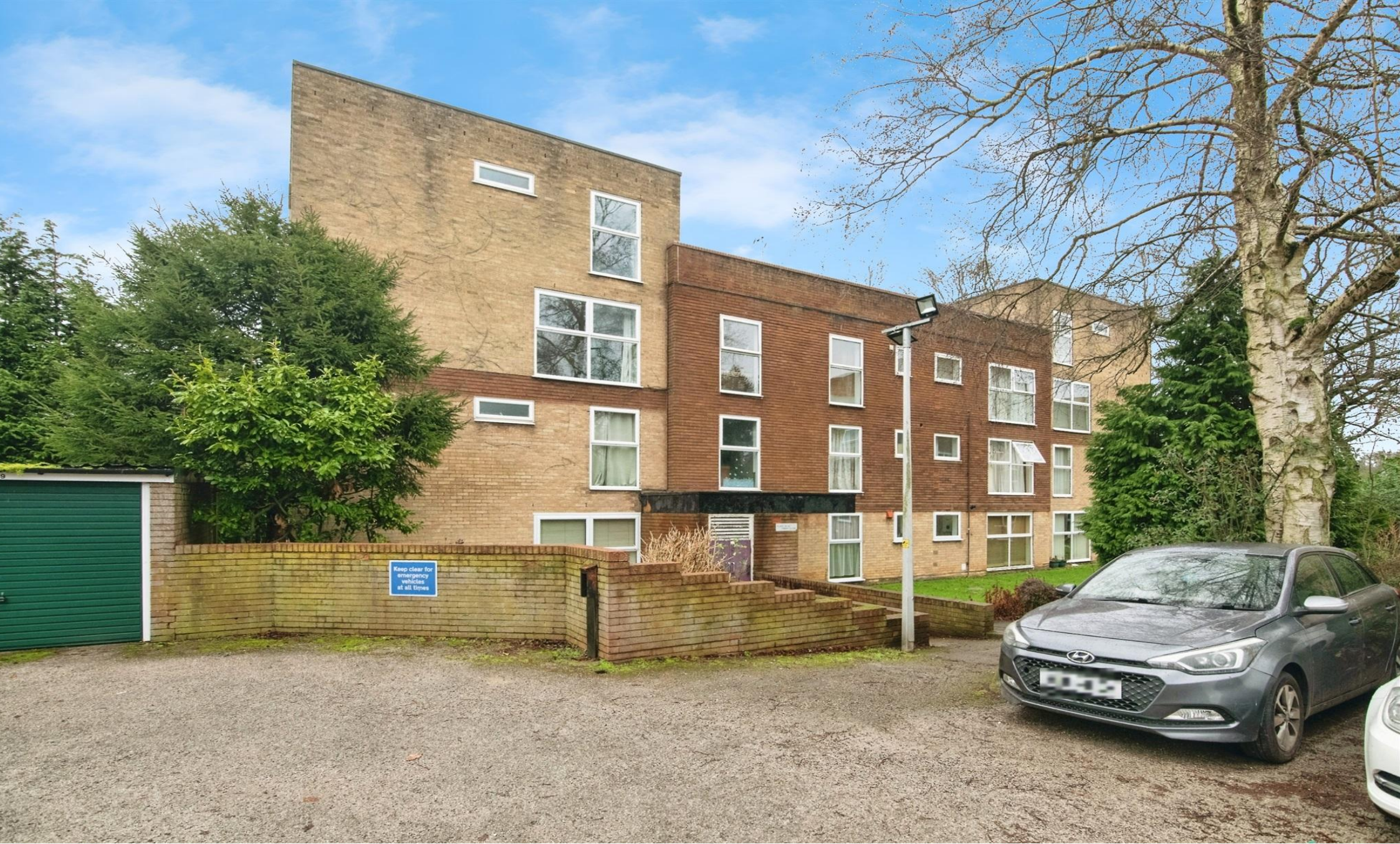
Friary Close Hamstead Hall Road,BIRMINGHAM B20 1HP