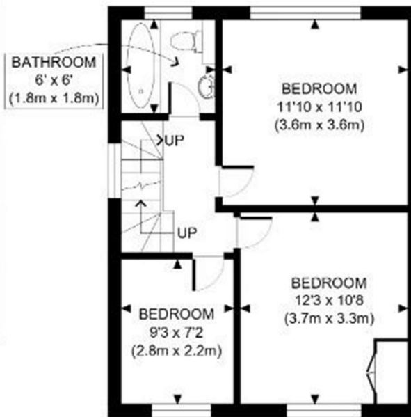
FIRST FLOOR GROSS INTERNAL FLOOR AREA 447 SQ FT

APPROX. GROSS INTERNAL FLOOR AREA WITH EAVES STORAGE: 1435 SQ FT/ 133 SQM APPROX. GROSS INTERNAL FLOOR AREA WITHOUT EAVES STORAGE: 1214 SQ FT/ 113 SQM