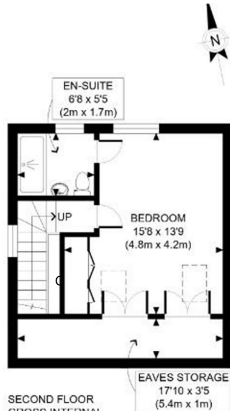
SECOND FLOOR GROSS INTERNAL FLOOR AREA WITH EAVES STORAGE 348 SQ FT FLOOR AREA WITHOUT EAVES STORAGE 279 SQ FT