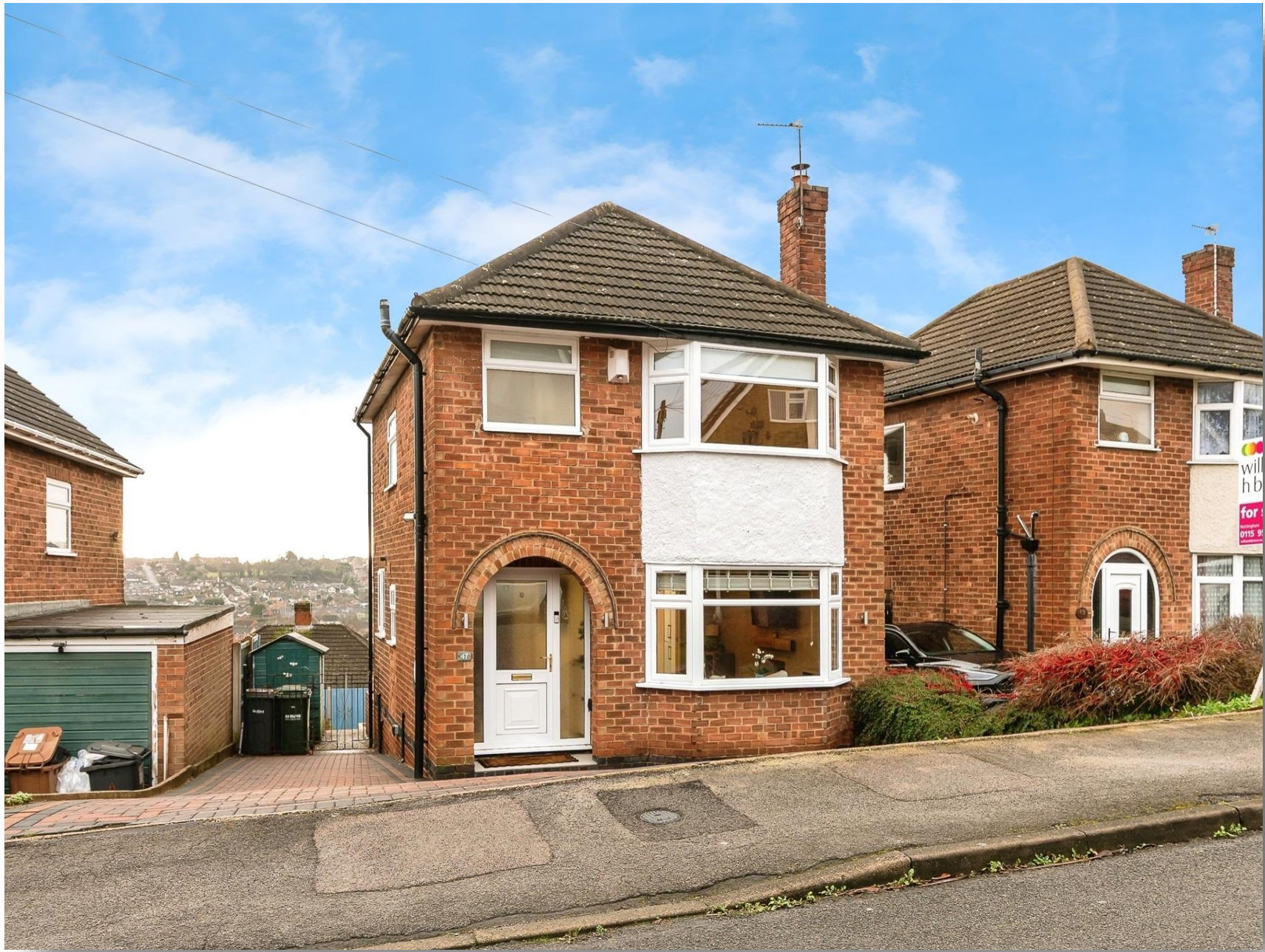
Violet Road, Carlton Nottingham NG4 3QQ