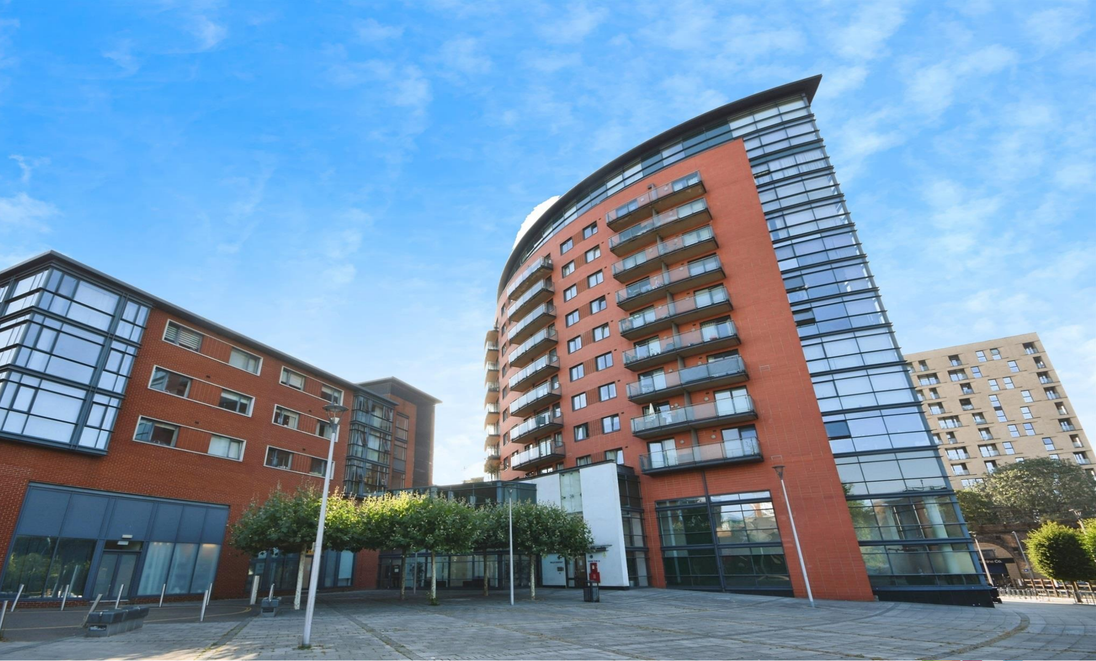
Wells Crescent, Viaduct Road, Chelmsford CM1 1GR