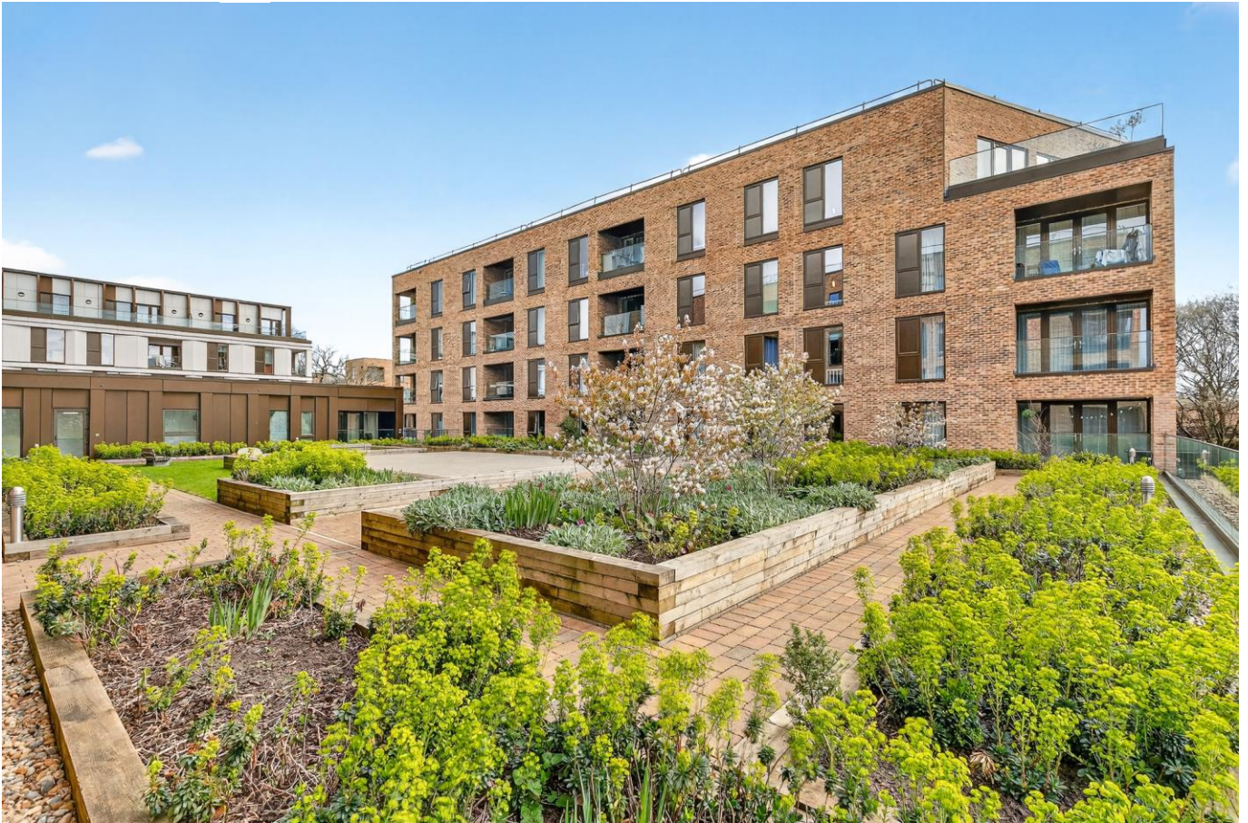
3 Carver House, Spitfire Chase, Walton-On-Thames, Surrey, KT12 1FX