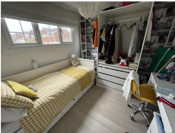
BEDROOM FOUR : A rear single bedroom with radiator and UPVC double glazed window.