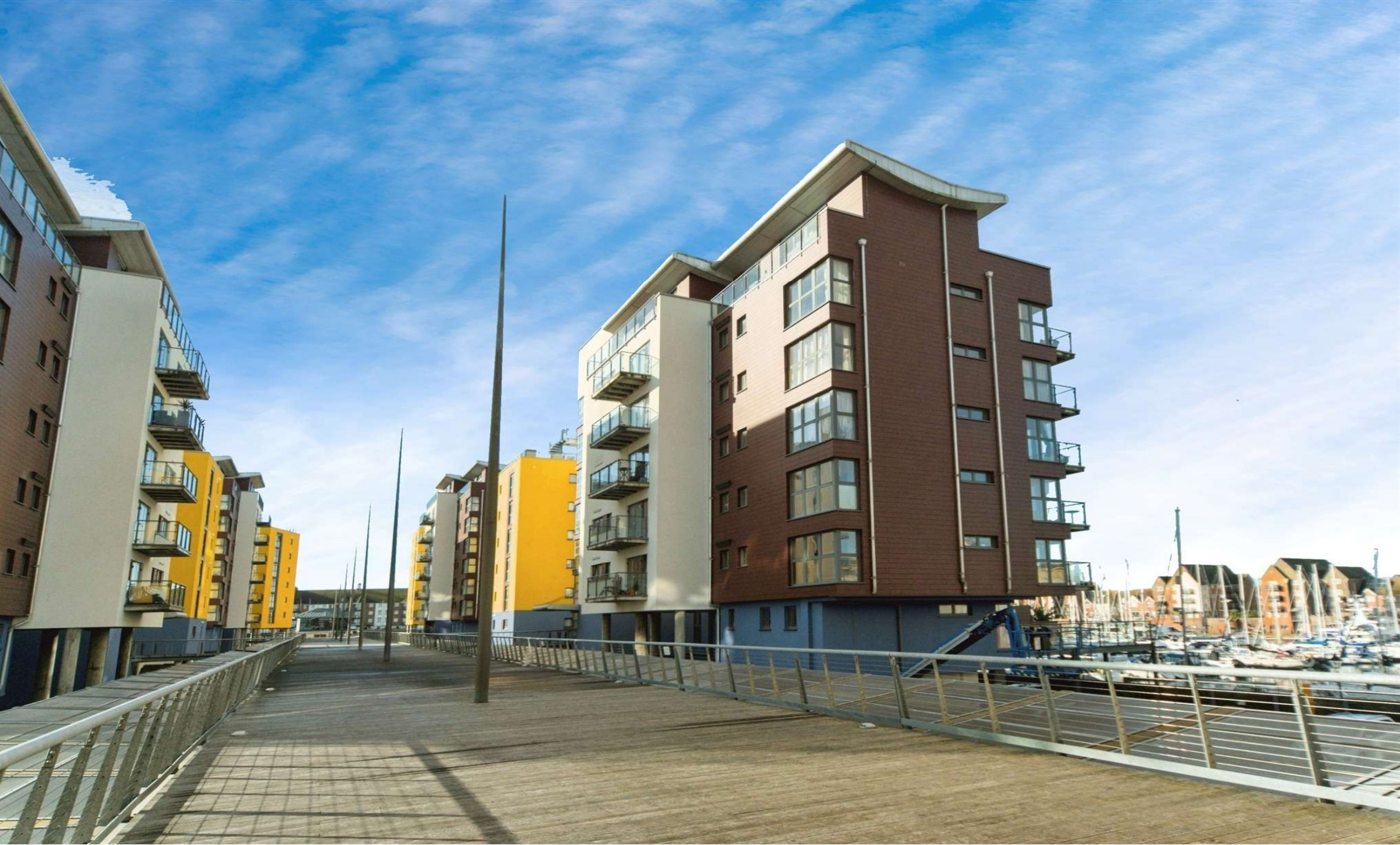
Palomar Court Midway Quay, Eastbourne BN23 5DE