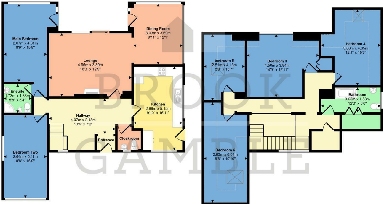
Ground Floor Approx 98 sq m / 1053 sq ft

Approx Gross Internal Area 185 sq m / 1993 sq ft