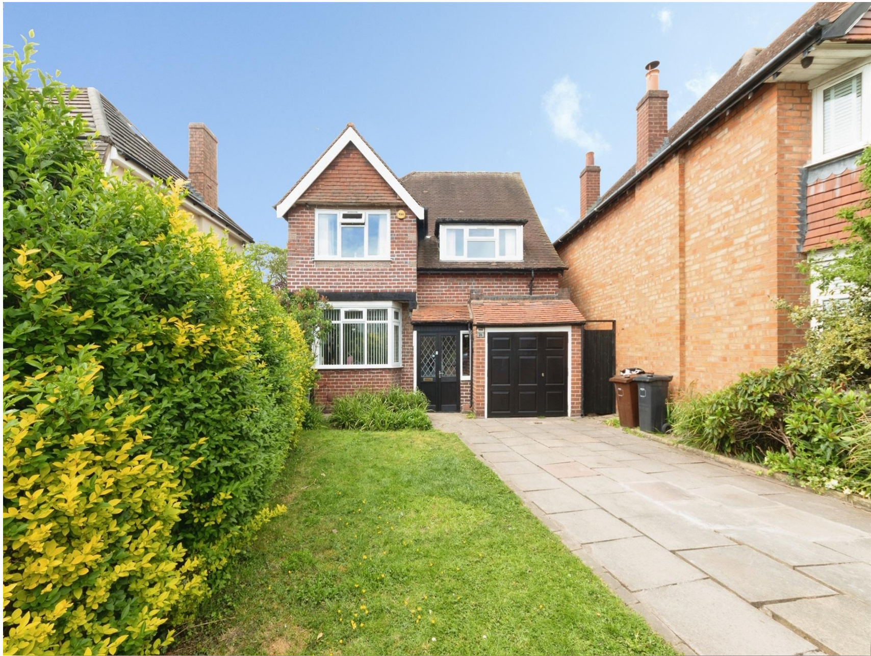
29a Hazeloak Road, Shirley Solihull B90 2AY