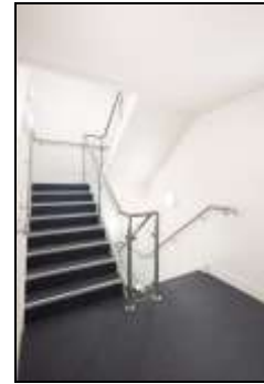
Communal Entrance Hall and Staircase