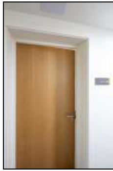
Communal Hallway and Flat Entrance Door