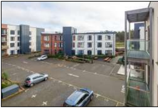
View from Windows