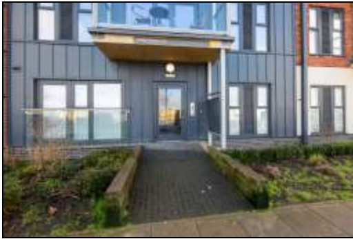
Entrance to Block