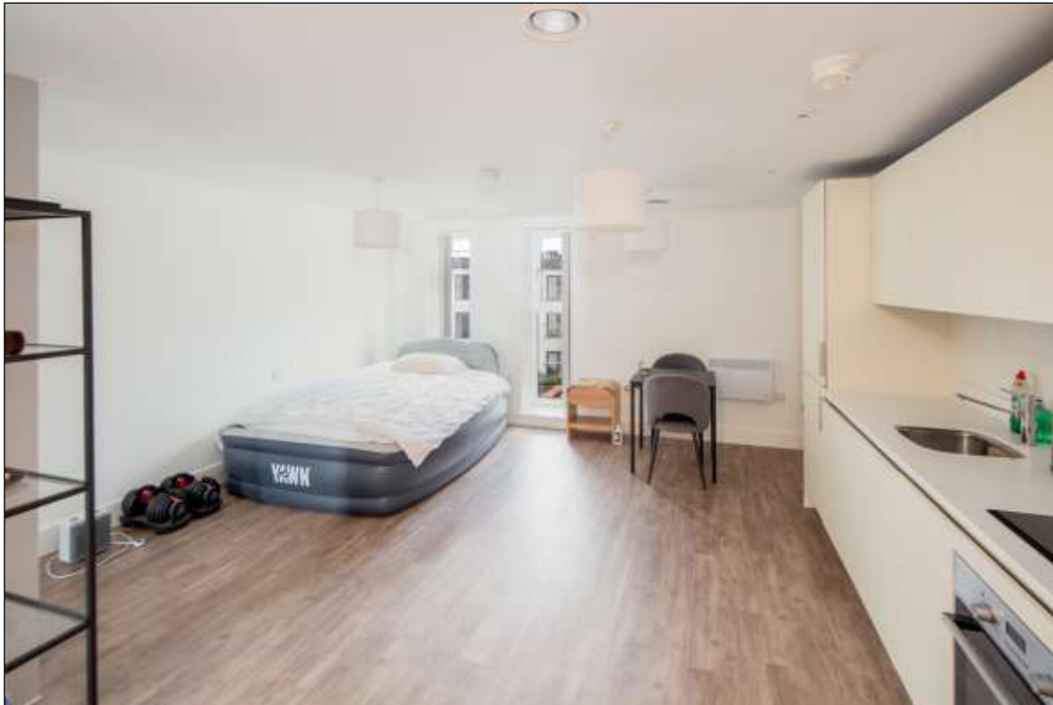
Open Plan Studio/Kitchen Area