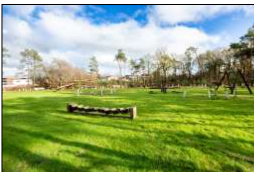
Park over the Road