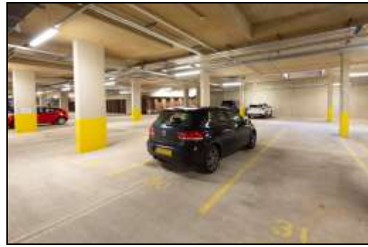
Undercroft Parking (actual parking space TBC)