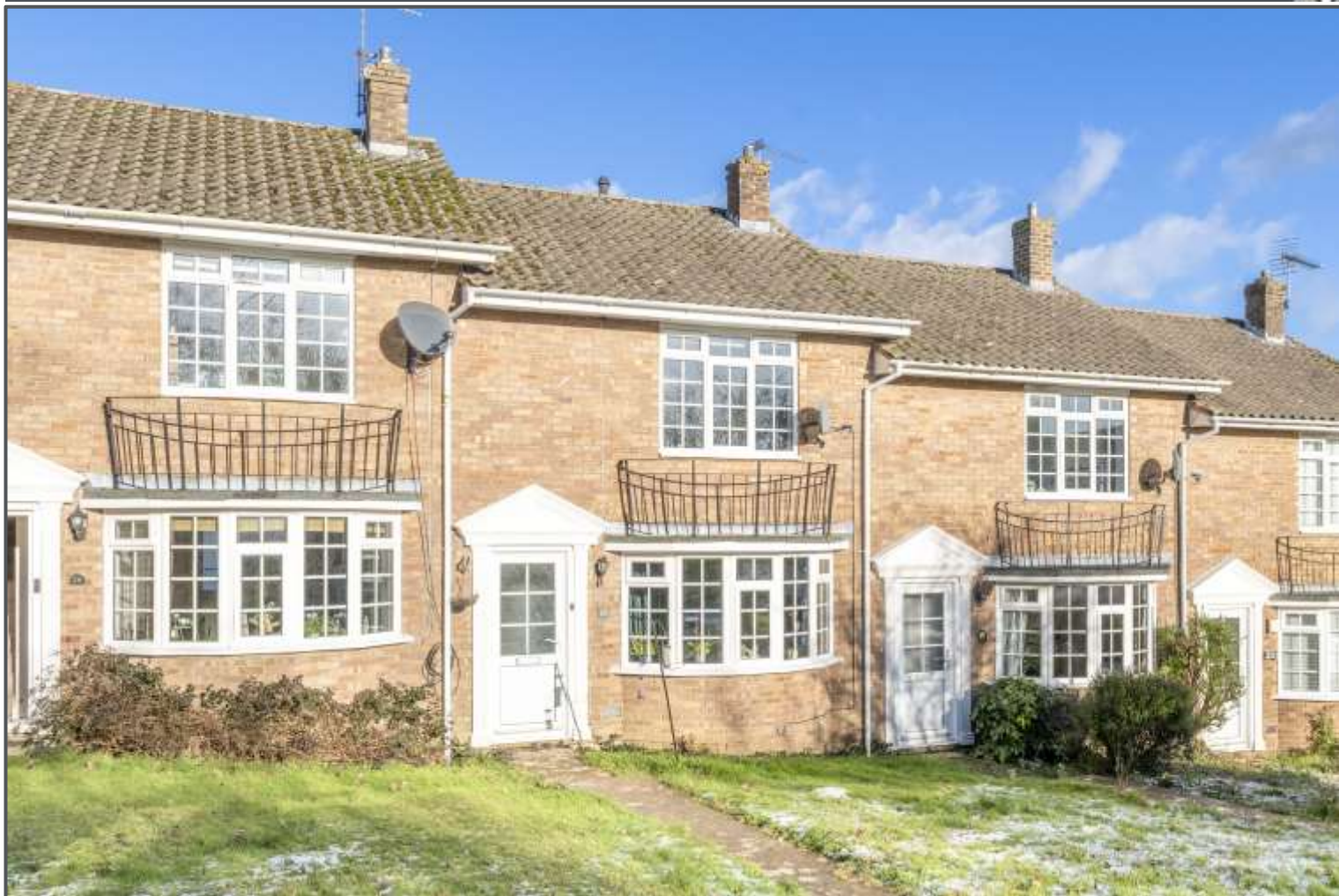
Senlac Green, Uckfield, TN22 1LT