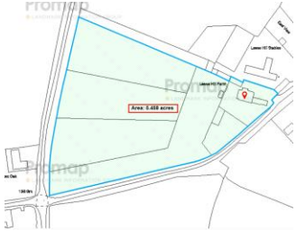
AWAITING EPC MEDIA

Survey Services - If we refer clients to recommended surveyors, it is your decision whether you choose to deal with this surveyor. In making that decision, you should know that we receive up to £90 per referral.