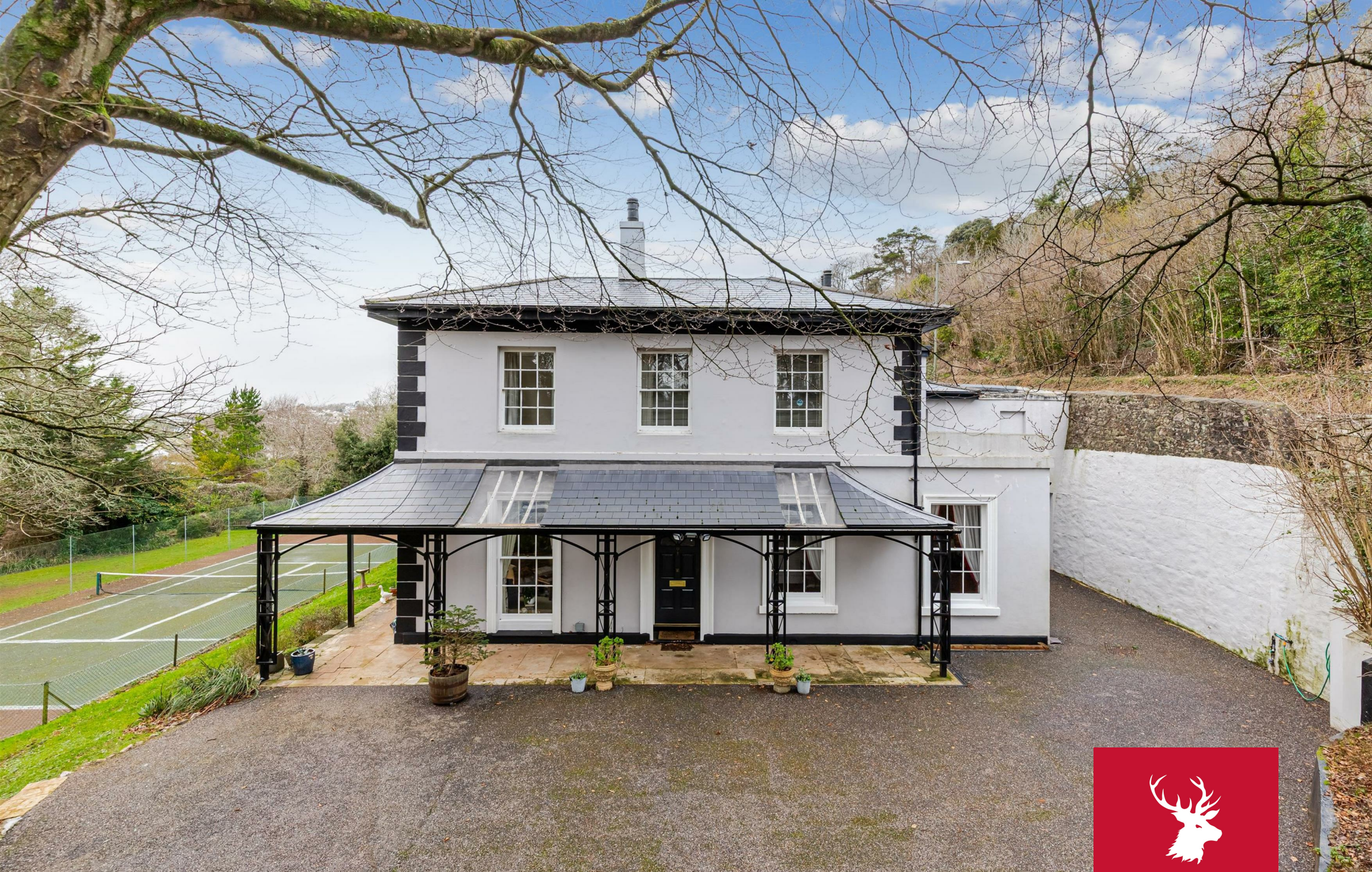
Watcombe Hill House