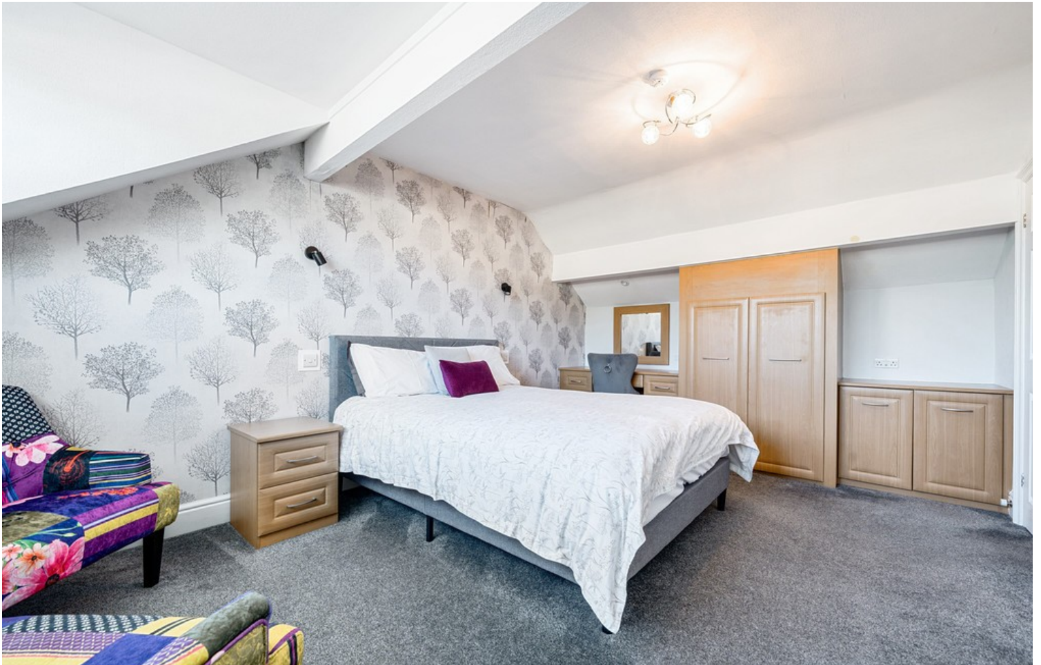
Bedroom 4 (Numbered 7)