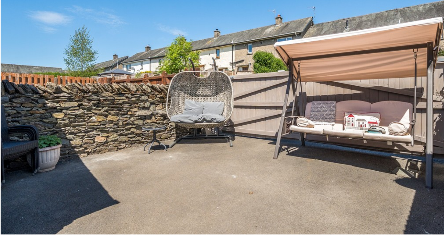
Rear garden/Sun trap