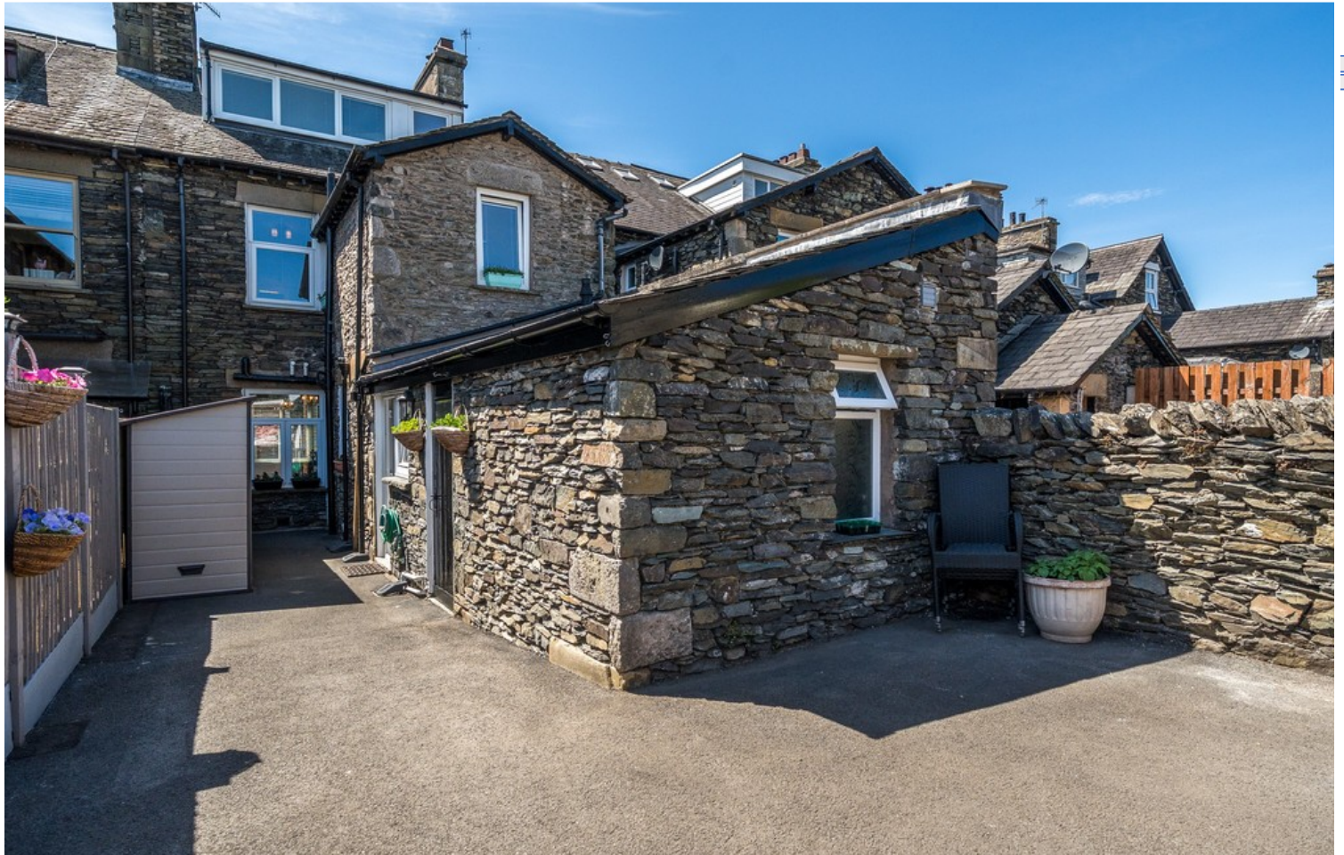
Rear garden/car park

Request a Viewing Online or Call 015394 44461