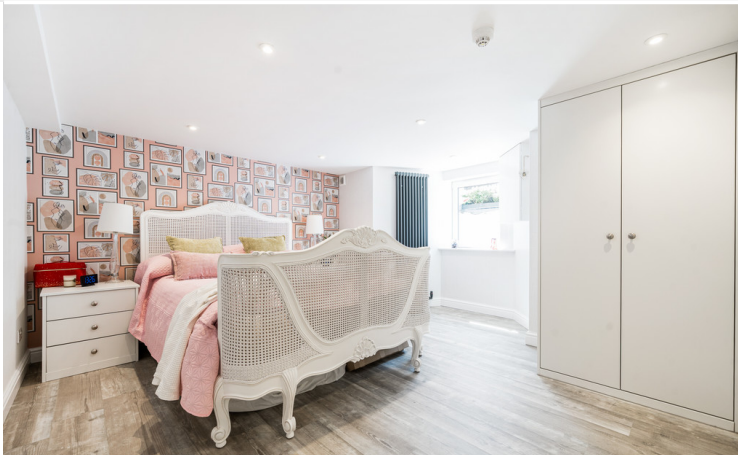
Owners accomodation - bedroom 1 lower ground floor