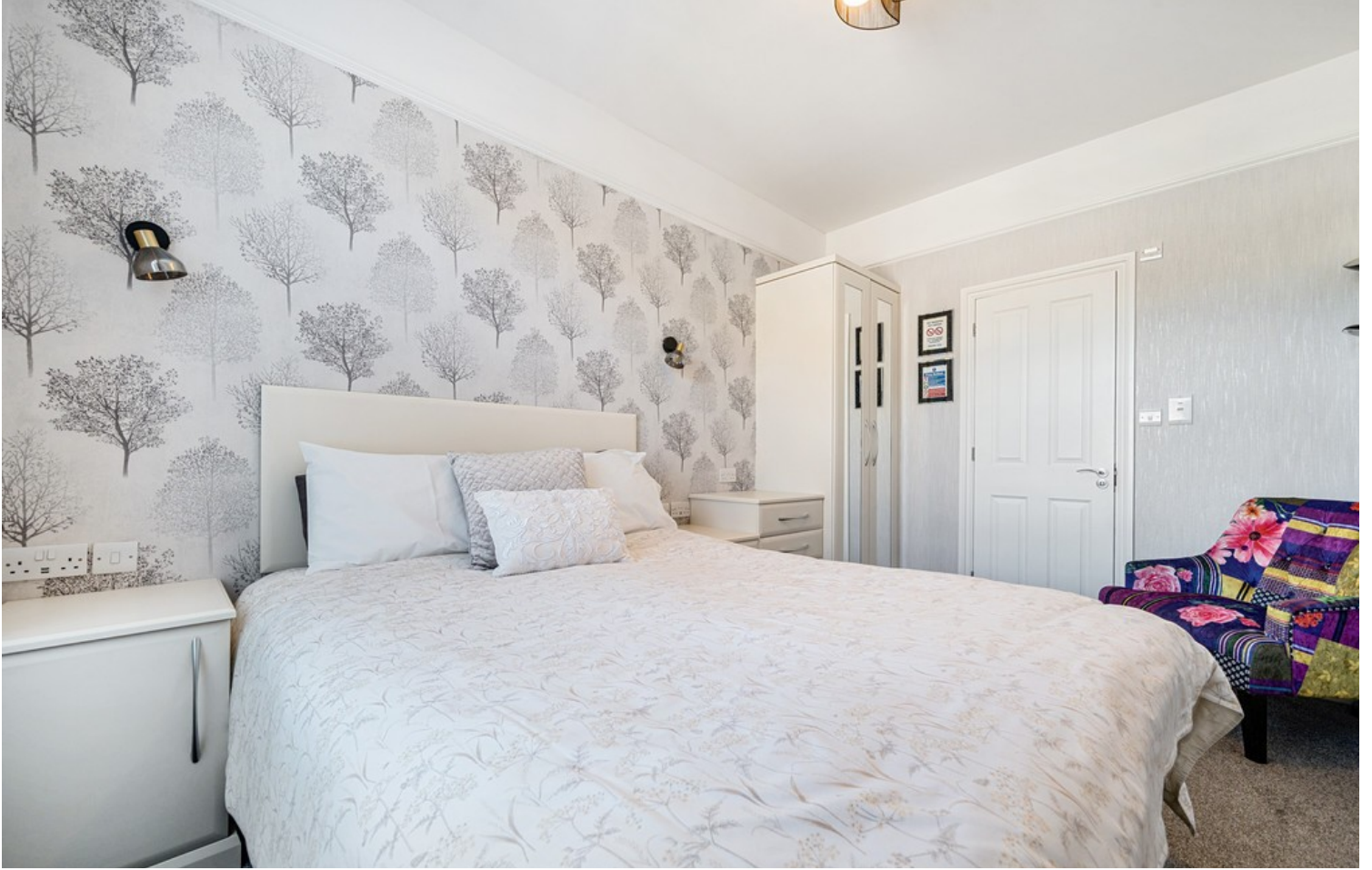
Bedroom 3 (Numbered 5)