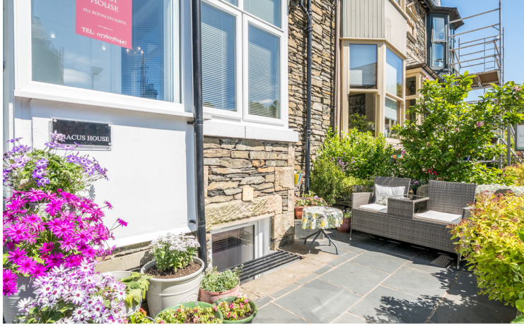
Front Garden/seating area