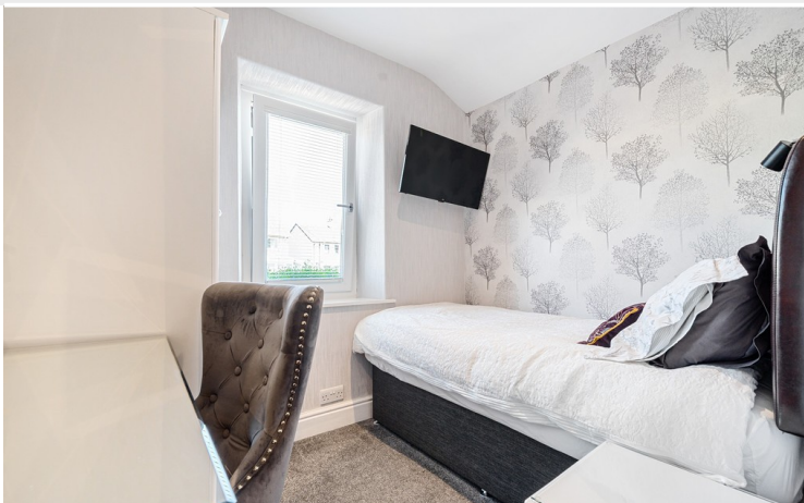
Bedroom 2 (Numbered 4)

Request a Viewing Online or Call 015394 44461