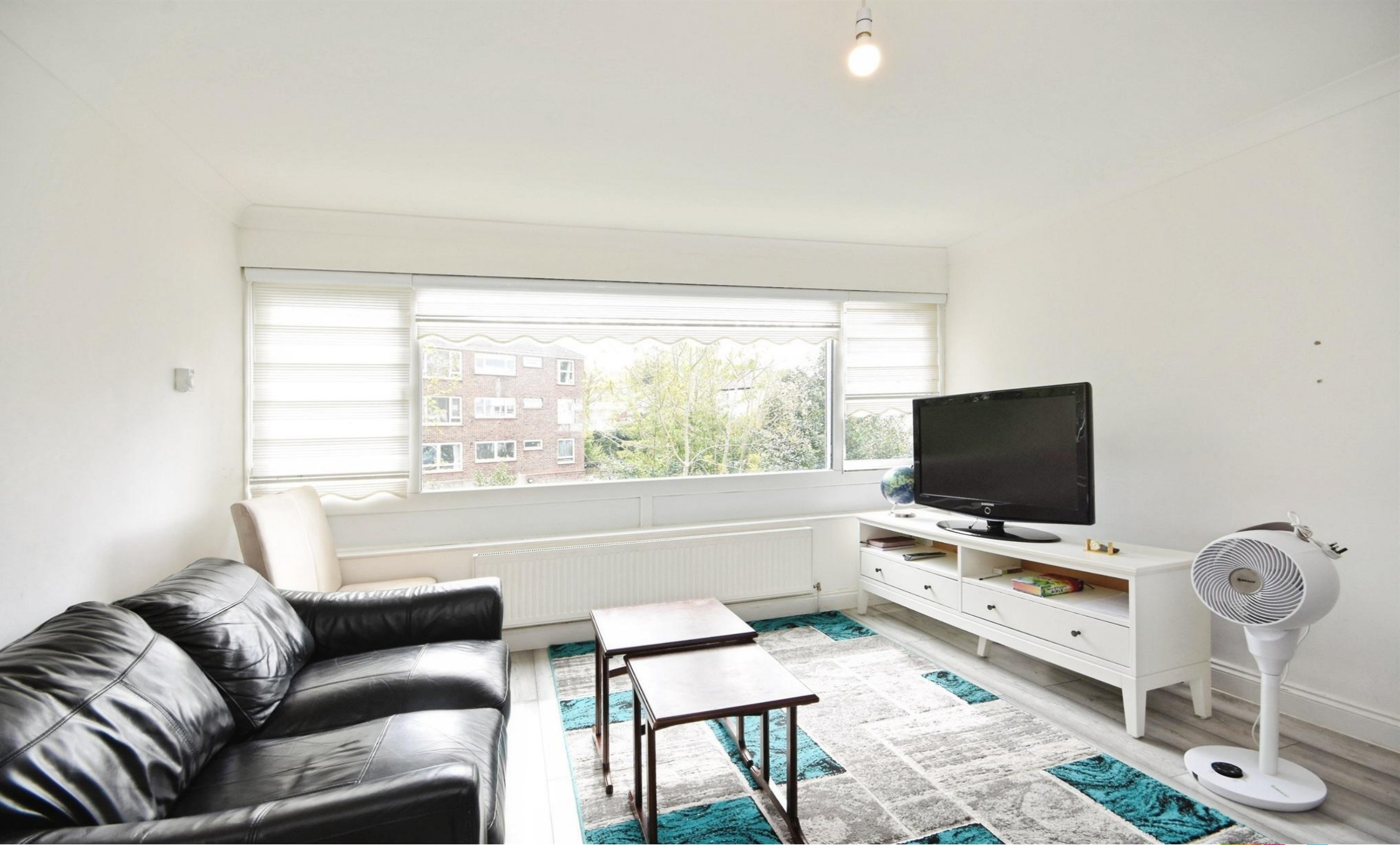
Cawdor House, Cameron Close, Warley, Brentwood, CM14 5BZ