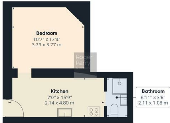
Annex Ground floor Building 1