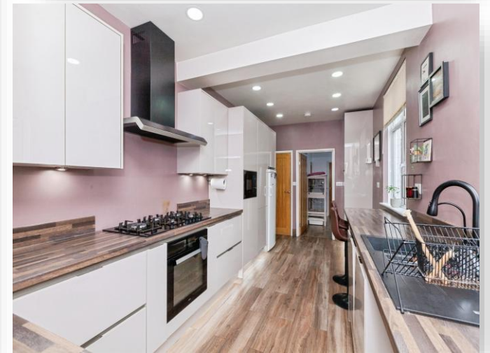
Parry Street, LEICESTER LE5 3NL