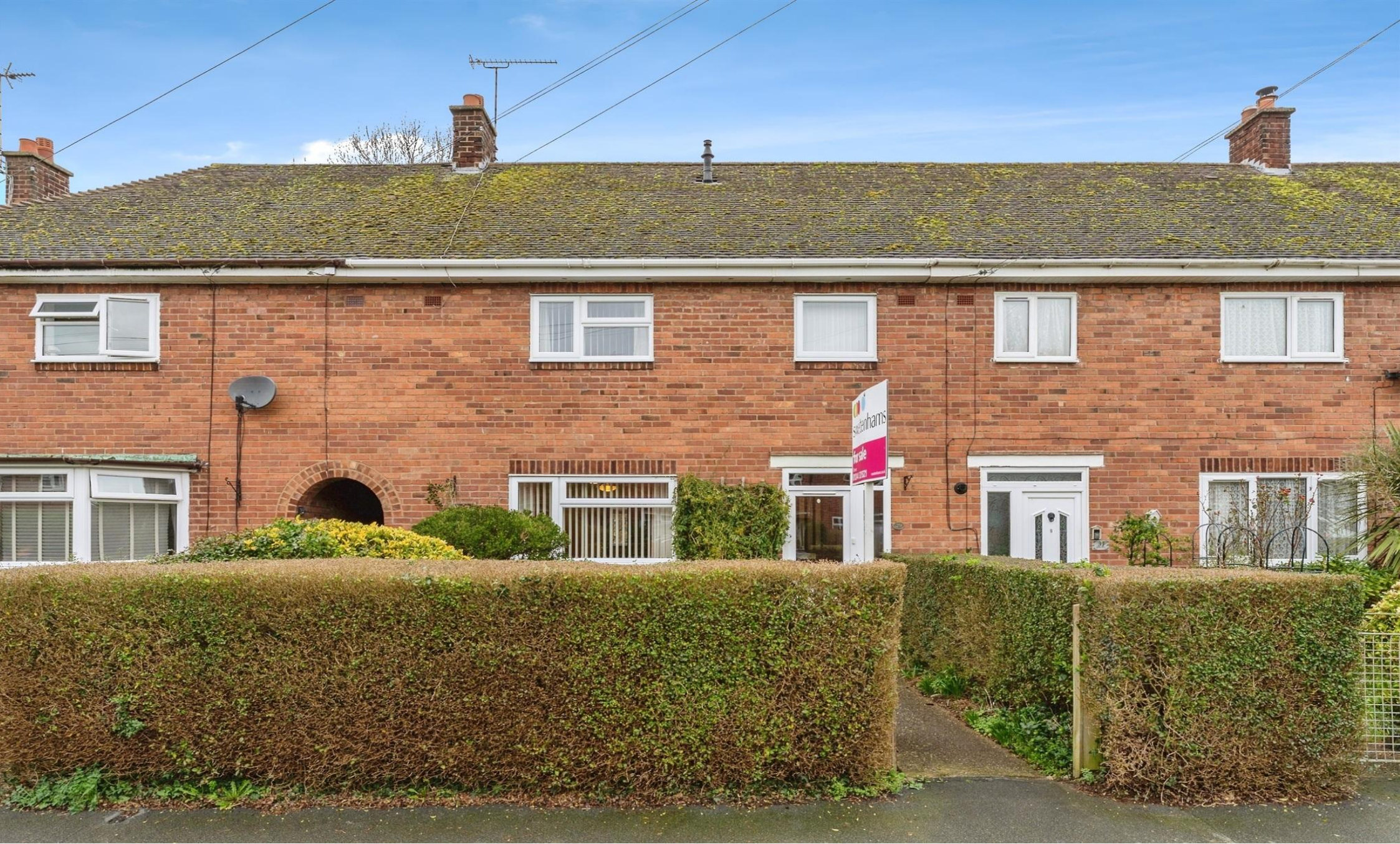
Rake Way, Saughall Chester CH1 6AZ