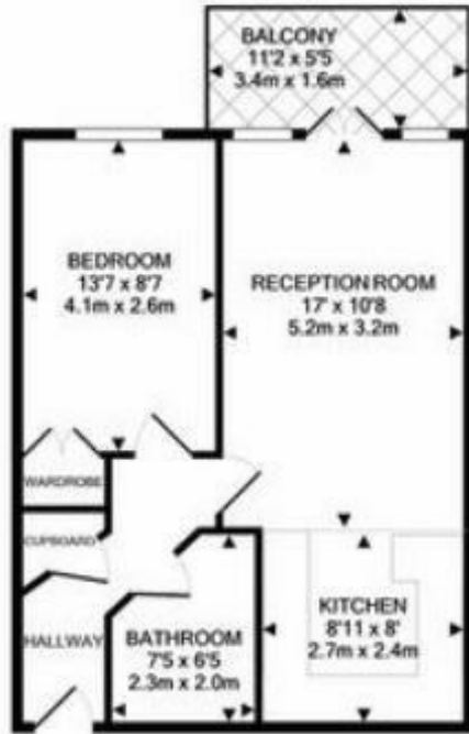
DRAKE HOUSE, LIMEHOUSE BASIN E14 - 2ND FLOOR TOTAL APPROX. FLOOR AREA 483 SQ.FT. (44.9 SQ.M.)

All every attempt has been made to ensure the accuracy of the floor plan contained here, measurements floor, windows, rooms and any other items are approximate and no responsibility is taken for any error, omission, or mis-statement. This plan is for illustrative purposes only and should be used as such by any prospective purchaser. The services, systems and appliances shown have not been listed and no guarantee as to their operability or efficiency can be given. Made with Metropor ©2020