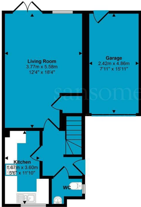
Ground Floor Approx 49 sq m / 523 sq ft

Approx Gross Internal Area 95 sq m / 1022 sq ft