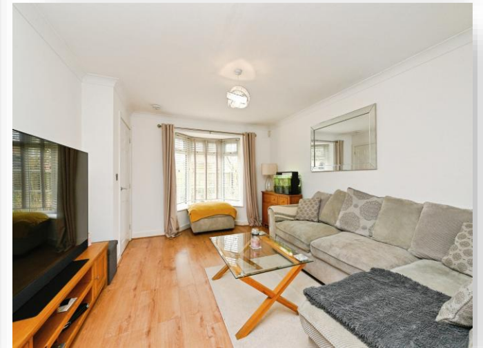
Strawberry Fields, Ely Row, Terrington St. John, Wisbech, PE14 7RS