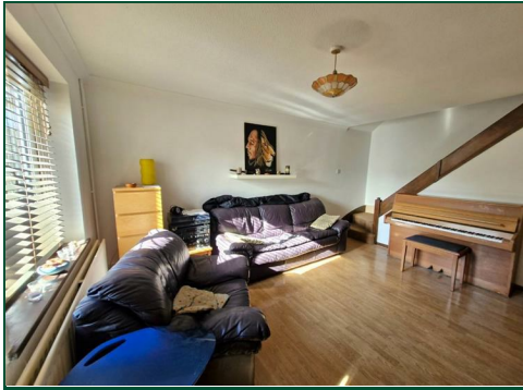
GROUND FLOOR 319 sq.ft. (29.6 sq.m.) approx.