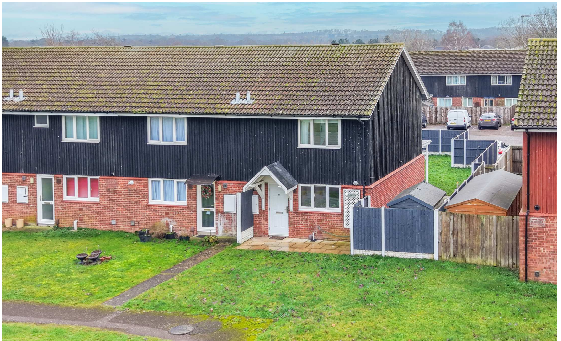
Aureole Walk, Newmarket, Suffolk