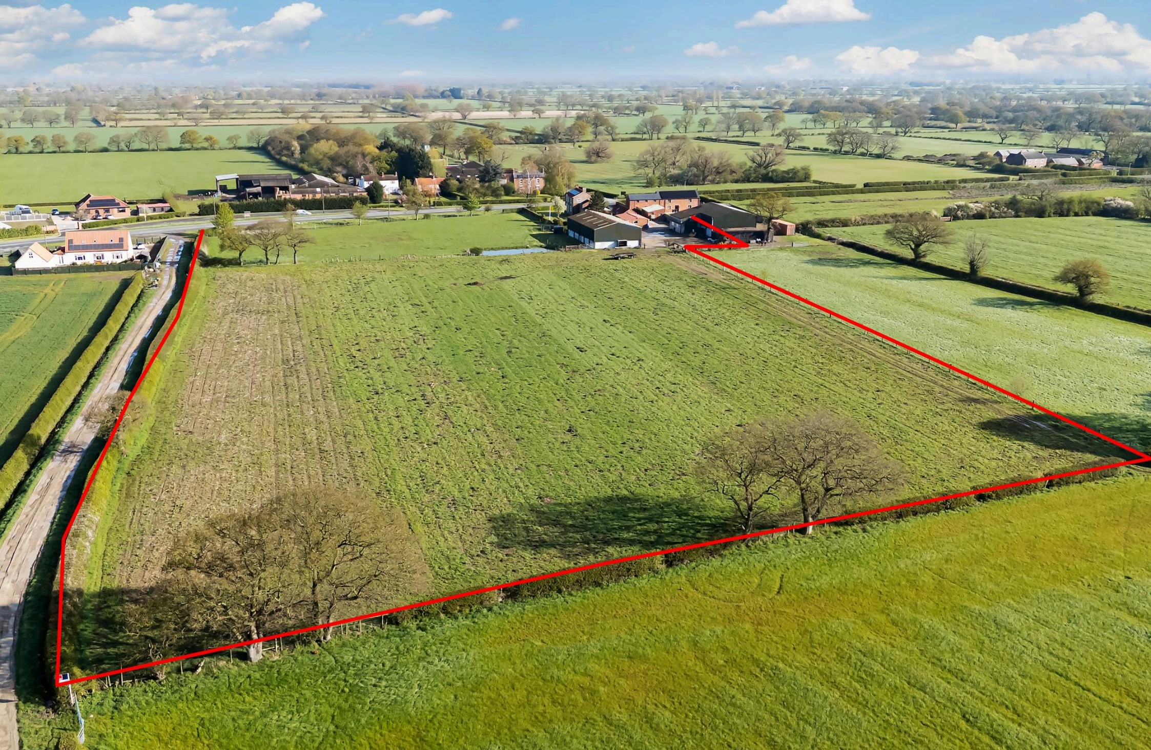
FAMILY HOME WITH AN ANNEX, SOLAR PANELS, FARM BUILDINGS, CAR PORT & 6 ACRES