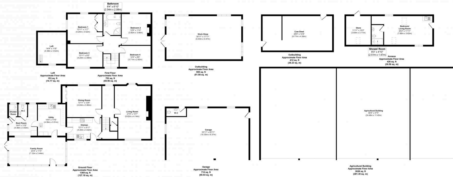
Illustration for identification purposes only, measurements approximate, not to scale. Copyrighted and Produced by MS Property Marketing.