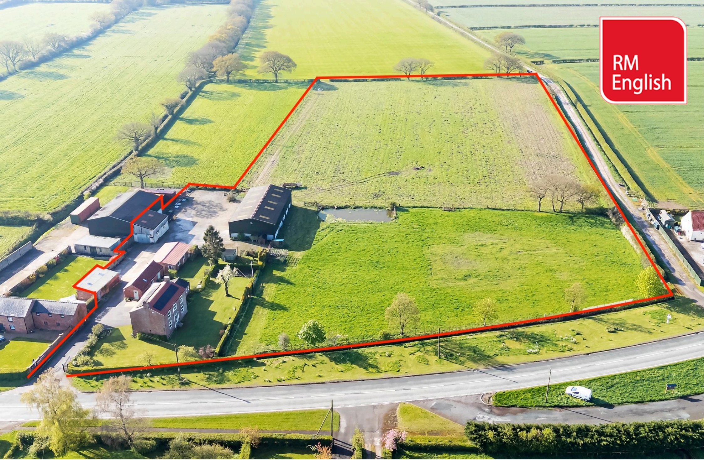
Harlthorpe, York, East Yorkshire, YO8 6DW