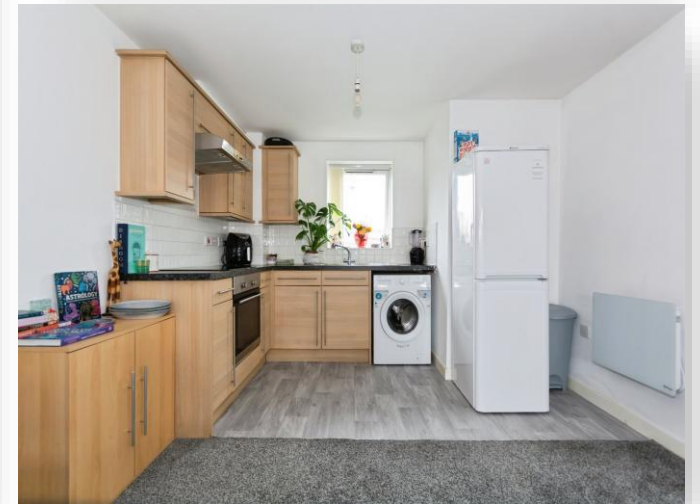
Barleycorn Drive, Birmingham B16 0NA