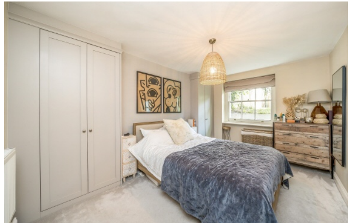
Shooters Hill Road, SE3