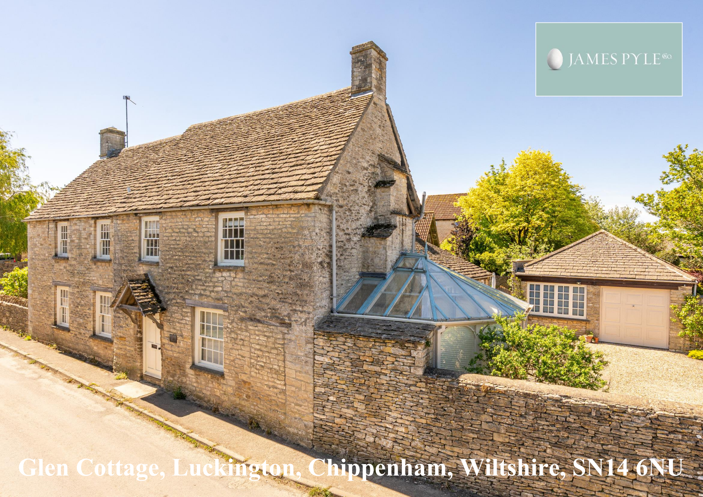
Glen Cottage, Luckington, Chippenham, Wiltshire, SN14 6NU