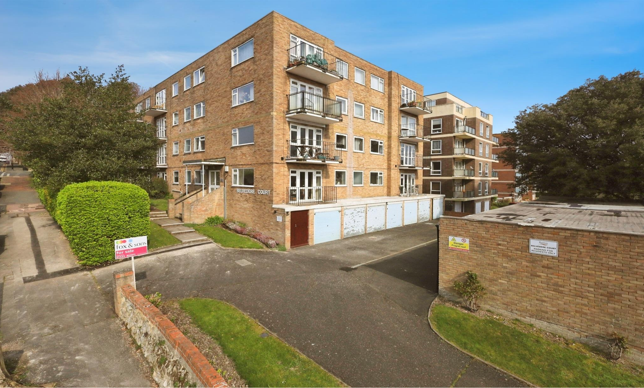
Belvedere Court St. Annes Road, Eastbourne BN21 2HH