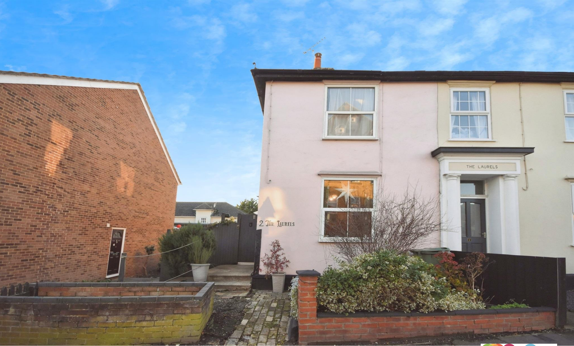
The Laurels, Railway Street, BRAINTREE, CM7 3JS