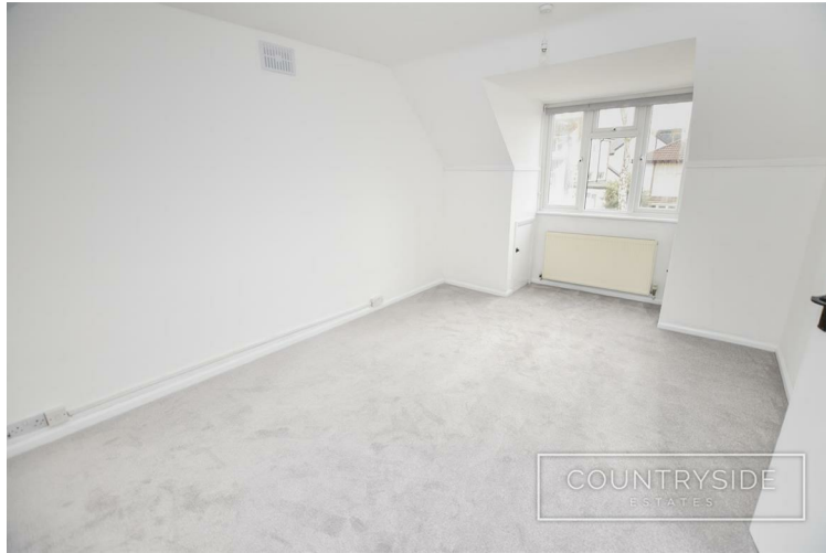
Bedroom One 16'4 x 11 (4.98m x 3.35m)

Window to front with views, radiator, two eaves cupboards.