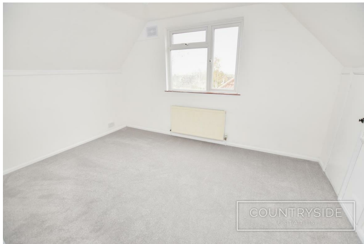
Bedroom Two 14 x 10'7 (4.27m x 3.23m)

Window to flank with excellent views, radiator, loft access, eaves cupboard.