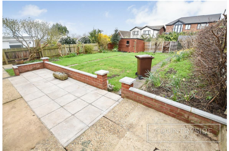
Rear Garden 40 x 60 (12.19m x 18.29m)

Fenced to boundaries, two wooden sheds, side entrance with gate, water tap, raised patio area with retaining brick wall, lawned areas, flower beds.