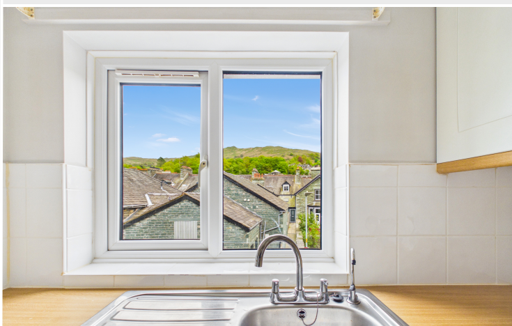
View from Kitchen Window