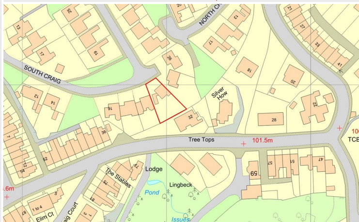
Ordnance Survey Ref: M4P-01130601