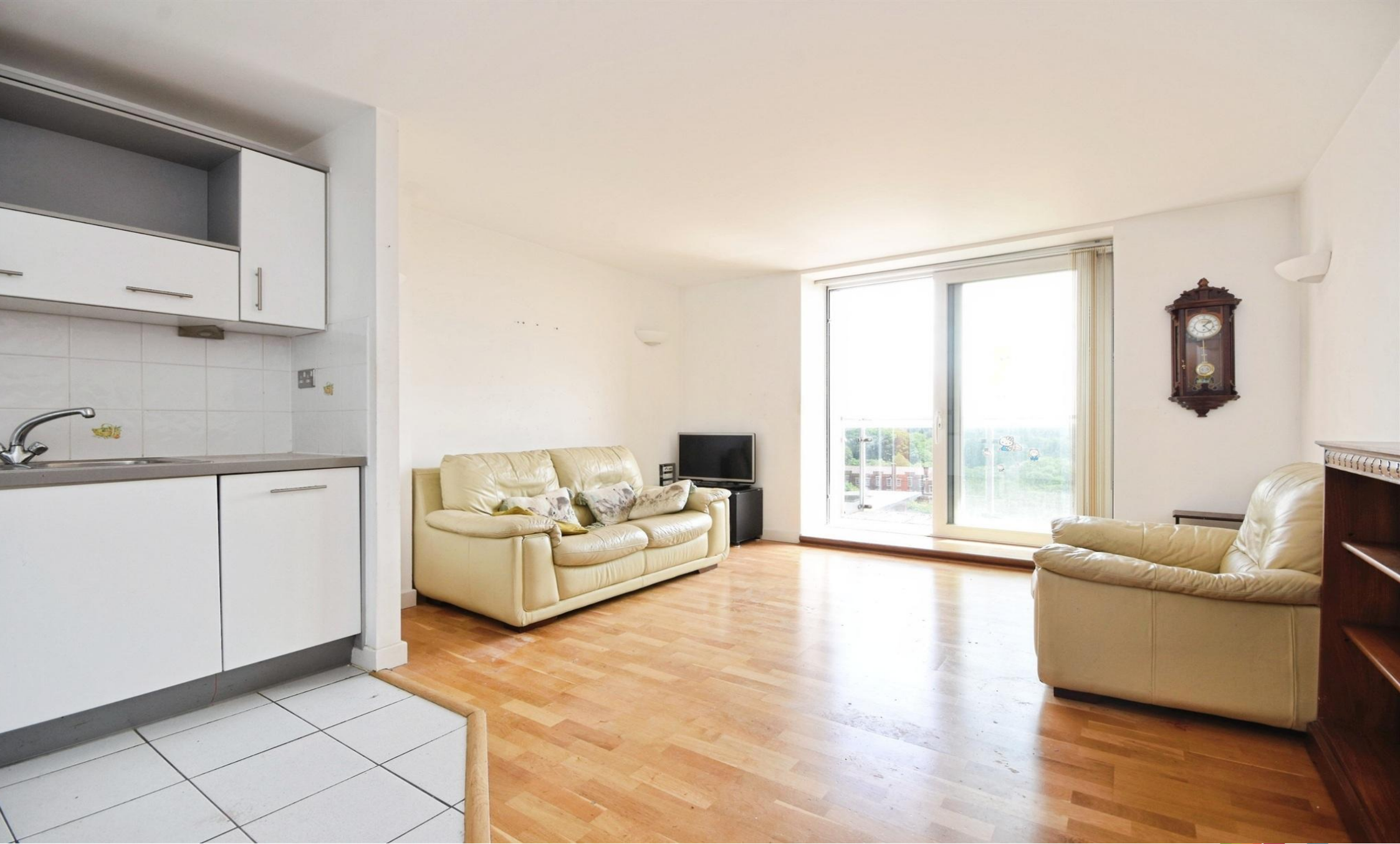
Becket House, New Road, Brentwood, CM14 4GB