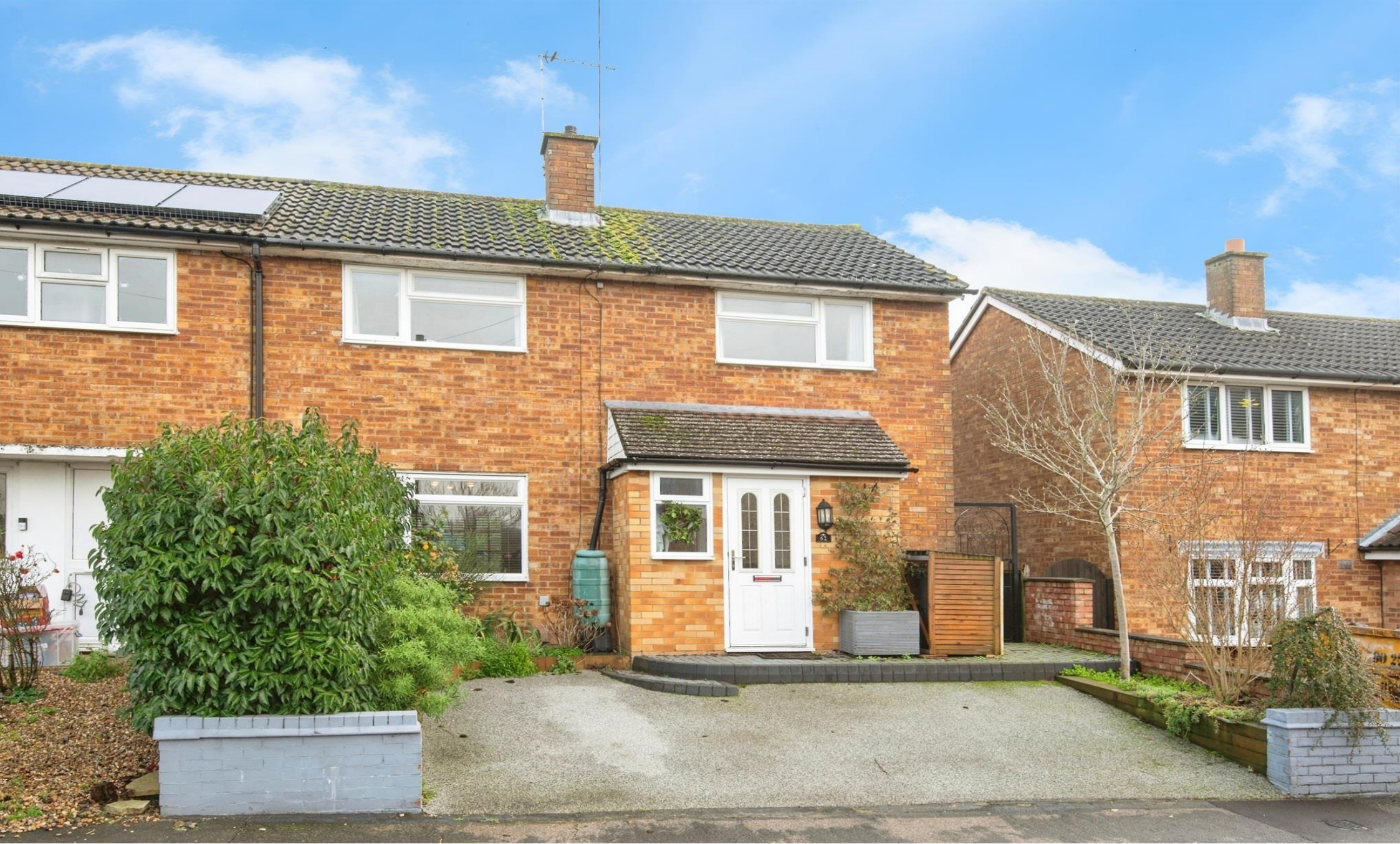
The Paddocks, Stevenage, SG2 9TZ