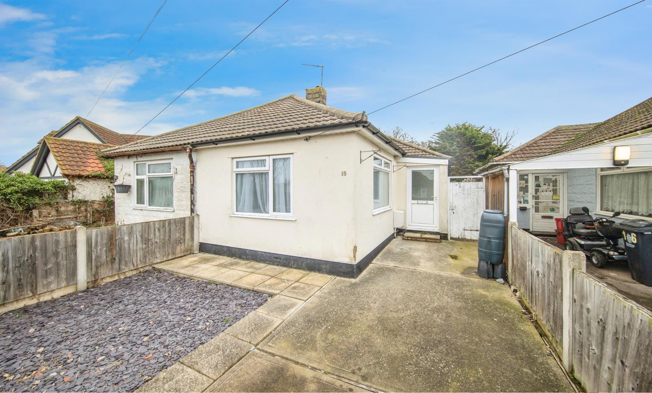
Meadow Close, CLACTON-ON-SEA CO15 4SN