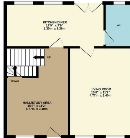
GROUND FLOOR 522 sq.ft. (48.5 sq.m.) approx.