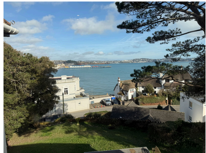
Top Floor Apartment - 21 Kingswood Court

An opportunity to acquire a well presented second-floor apartment enjoying breathtaking panoramic sea views, ideally positioned just off the highly sought-after harbourside in Roundham , Paignton. The property comprises two bedrooms and a superb open-plan, dual-aspect living space that captures sweeping views across Torbay, Paignton Harbour, the Beach and the promenade. A contemporary kitchen, finished with a stylish blend of oak and granite styles, complements the living area perfectly. The apartment further benefits from a modern bathroom and a separate shower room. Features include gas central heating, double glazing, and a private balcony – the perfect spot to relax and take in the spectacular coastal outlook. Externally, residents enjoy well-maintained communal gardens, a garage, and visitor parking. Offered with no onward chain, this impressive seaside home would make an ideal permanent residence, holiday retreat, or investment opportunity.