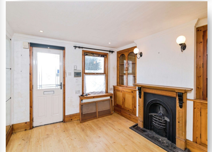
Commodore Road, Lowestoft NR32 3NF