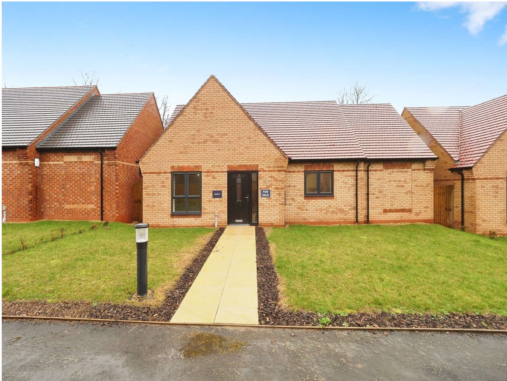
The Aspen Valley Lane, Mansfield NG18 2FP