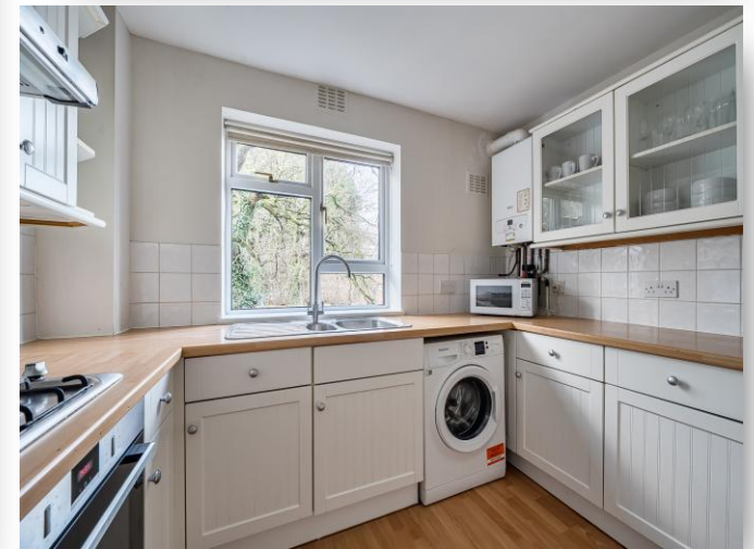
3 Sussex Lodge, Courtlands, Maidenhead SL6 2PS