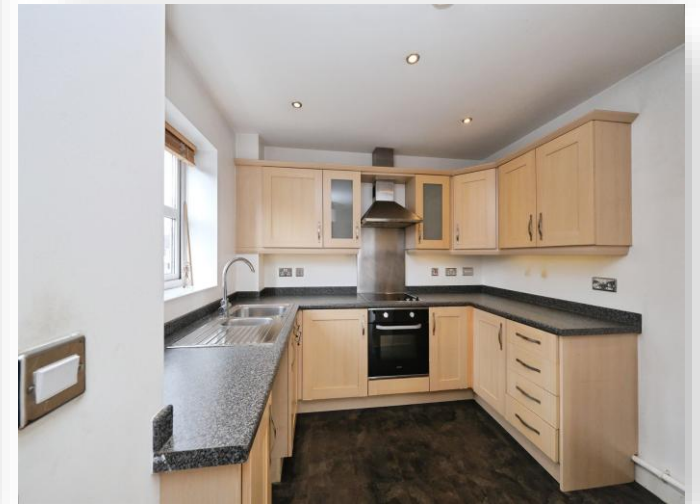
Manor Gardens Close, Loughborough