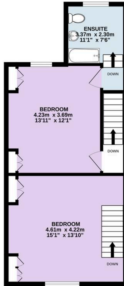
1ST FLOOR 44.2 sq.m. (476 sq.ft.) approx.