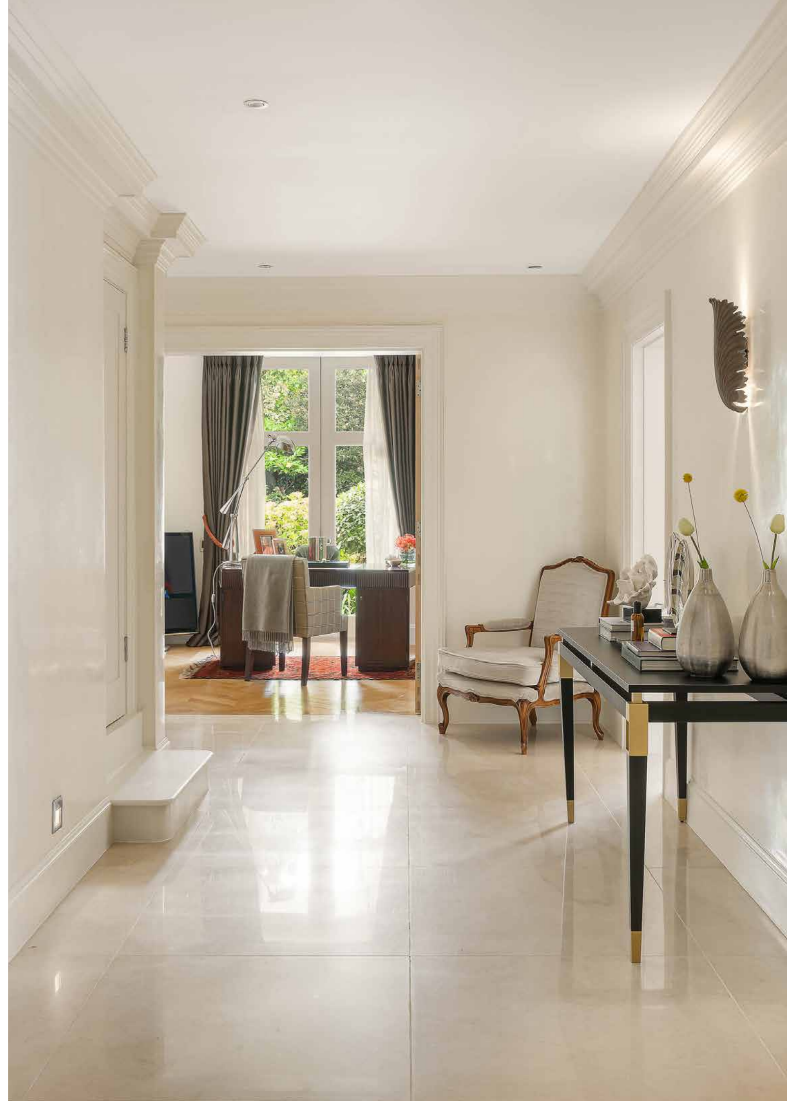
Right Entrance Hall