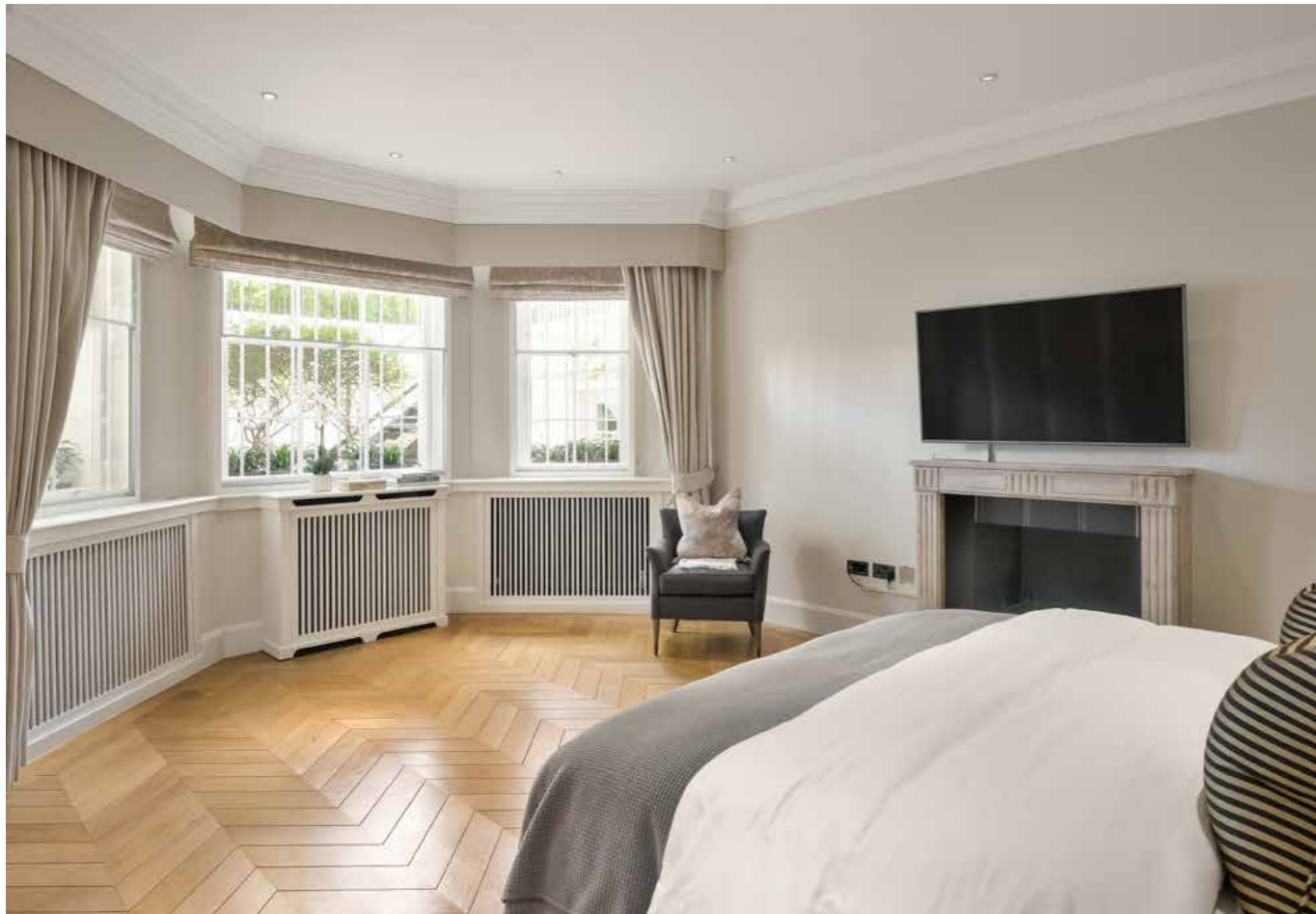
Above Left Bedroom 2