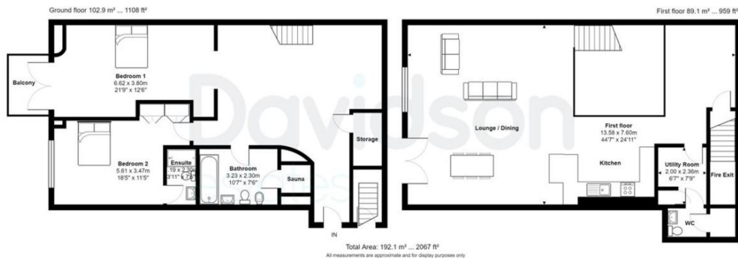
Floorplan measurements are for illustrative purpose only. Floor plan by www.sebastiano.co.uk.