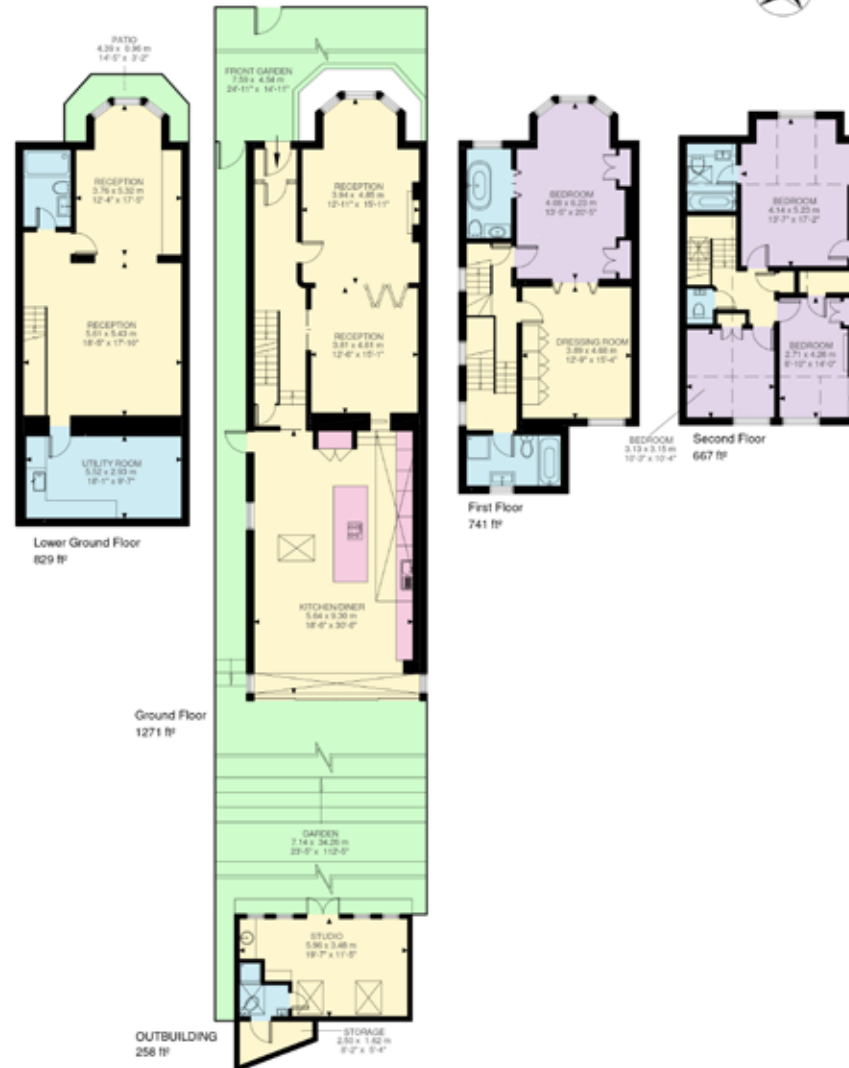
Illustration for identification purposes only. measurements are approximate. Not to scale. Floor Plan Drawn According To RICS Guidelines.

Approximate Gross Internal Area = 325.92 sq m / 3,508 sq ft (Excluding Outbuilding) Outbuilding = 23.98 sq m / 258 sq ft Inclusive Total Area = 349.90 sq m / 3,766 sq ft